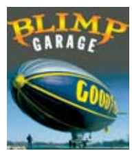
One of a series: The envelope top gets painted

The Blimp Garage crew was already at work by 7 a.m. Tuesday inside the Wingfoot Lake hangar. A two-person team used a motorized boom lift to maneuver up, down and around the 192-foot-long airship.